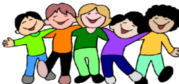
Academic Year 2018-2019